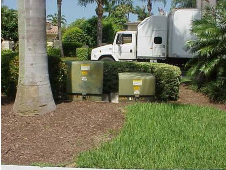
Figure 3-2. Underground equipment in the median of Allison Island.