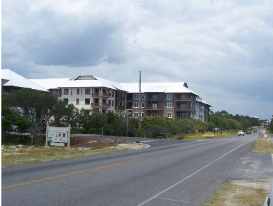
Figure 6-1. The residential development on County Road 30A. The owner of this development initiated and paid for the project.