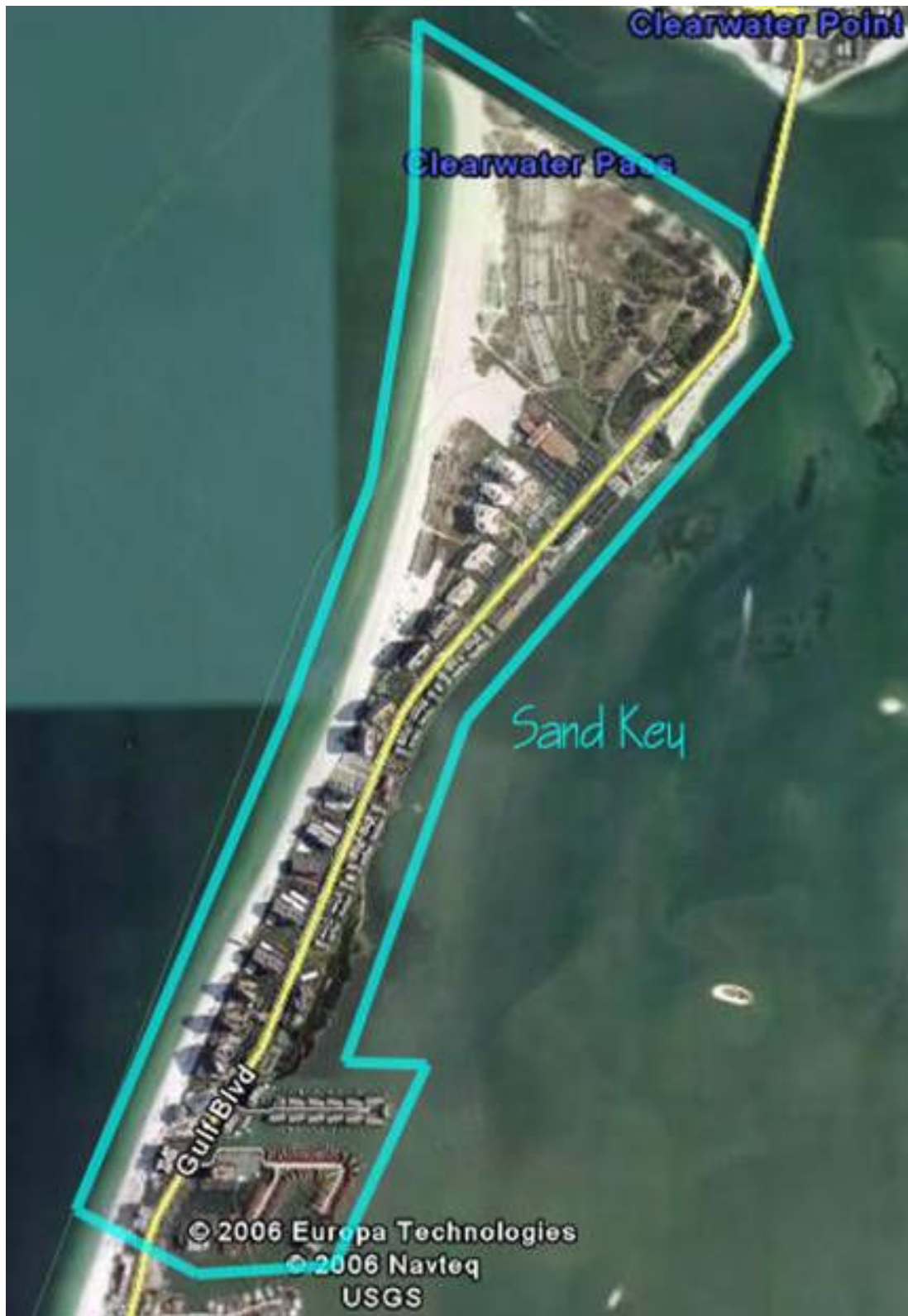
Figure 4-1. Sand Key