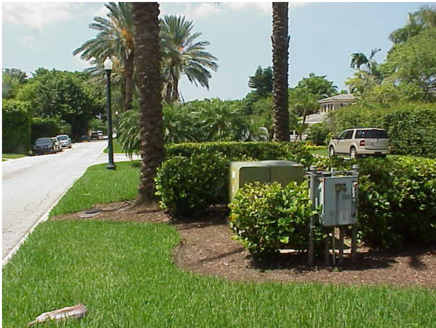
Figure 3-3. Underground equipment in the median of Allison Island.