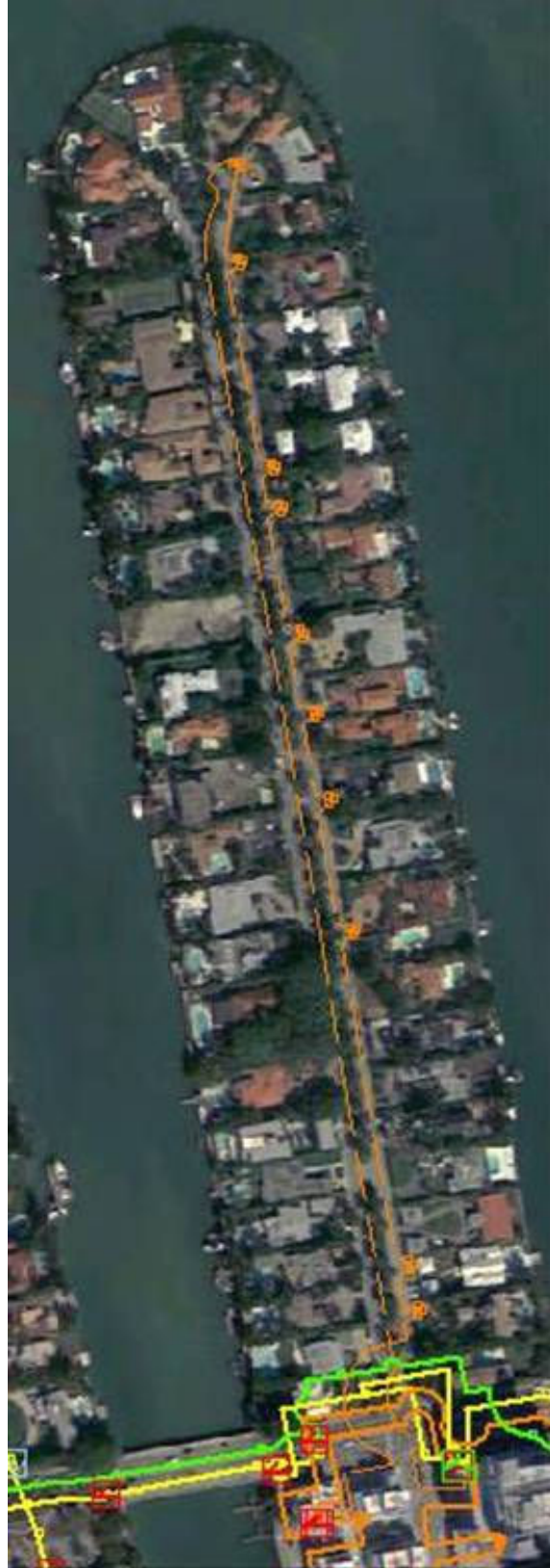
Figure 3-1. Allison Island Geography and Circuit Routing