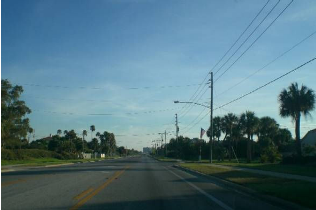
Figure 4-2. Overhead Construction Similar to that Used for Sand Key before Undergrounding (this is system is close, but not in Sand Key proper)