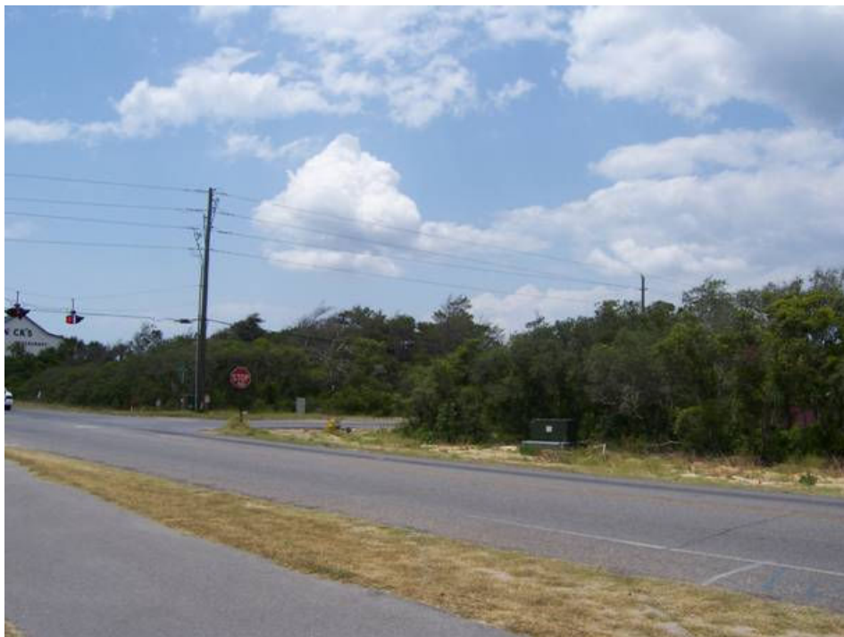
Figure 6-2. Overhead construction on a road crossing County Road 30A (similar to what existed on Country Road 30A before the undergrounding project).