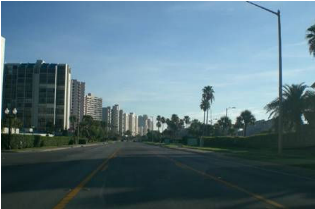
Figure 4-3. Sand Key After Undergrounding