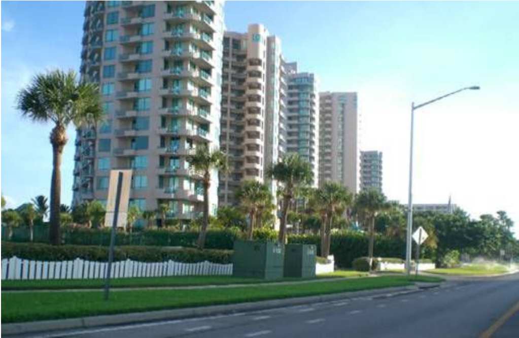
Figure 4-4. Pad Mounted Equipment on the Side of the Road in Sand Key