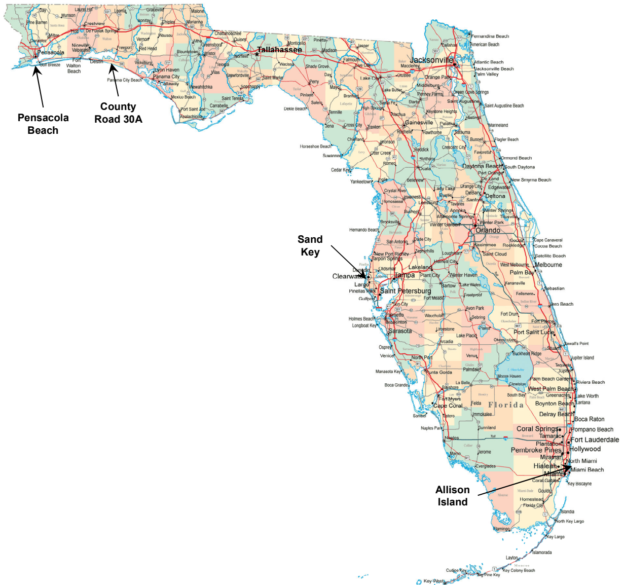
Figure 1-1. Location of Case Studies