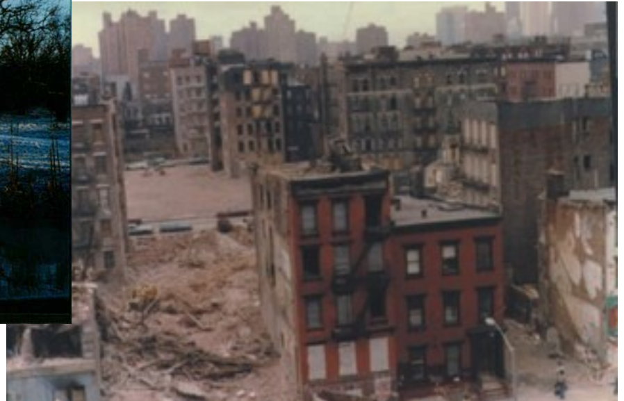
Fiber to the [South] Bronx